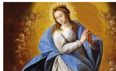
DECEMBER Month of the Immaculate Conception

PARISH OFFICE HOURS—Mon, Wed, and Friday 9.30am—1.30pm Office will be closed over statutory Holidays but can ring Parish Mobile 0225624671 Koha and Pledge Donations to our Parish gratefully received at this time. PAYWAVE Available on Weekend Masses or weekdays in office. Collection last week : $ 2,613.00 approx. Please include Name in Ref. with all direct Bank Deposits.