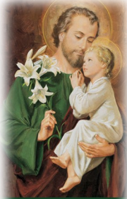
Saint Joseph, pray for us.

We continue our Lenten journey together. As we move through the weeks of Lent, we might stop to ask ourselves, "How is it going?" If you made Lenten promises, have you kept them? And if you aren't doing anything